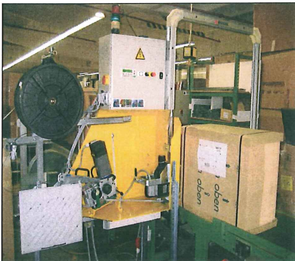
Fully automatic strapping of packaged kitchen cabinets